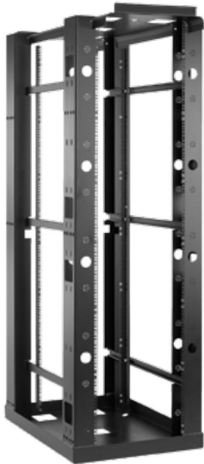
4-Post ganged with 2-Post or 4-Post Racks